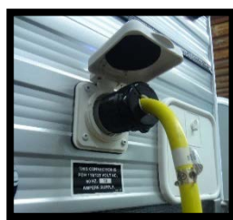
120V Shore Power