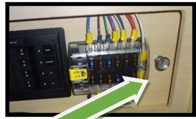
12V Kill Switch